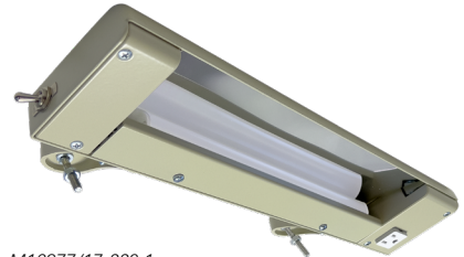
M16377/17-229.1 Rail Mounting