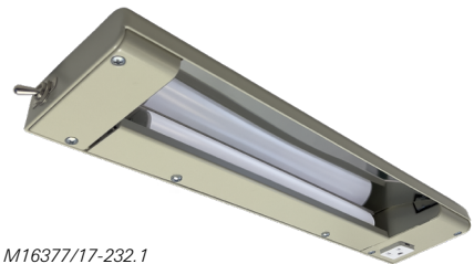
M16377/17-232.1 Bulkhead or Bar Mounting NSN 6210-01-603-8568 with receptacle