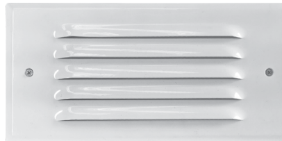
Louvered door option