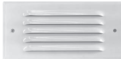
Louvered door option