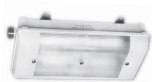
Standard Mount M16377/6-149.4 NSN 6210-00-548-0226

*Contact factory for more specified options.