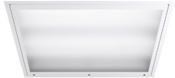
Flush Mount M16377/57-350SSL