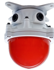
Red M16377/26-113SSL NSN: 6210-01-605-0603