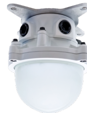
White M16377/26-112SSL NSN: 6210-01-585-6039