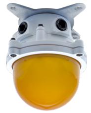
Amber M16377/26-113.1SSL NSN: 6210-01-605-0599