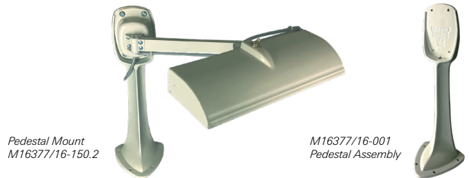
Pedestal Mount M16377/16-150.2