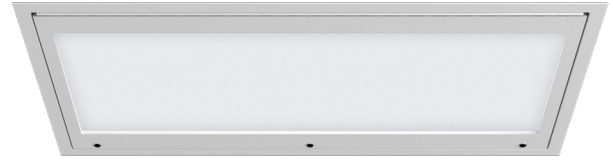
Flush Mount M16377/57-348 NSN 6210-00-115-9186