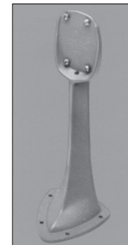
M16377/16-001 Pedestal Assembly NSN 6230-00-336-5876

Net Weight: 2 lbs. 7 oz. maximum. Approximate shipping weight for package of ten: 42 lbs