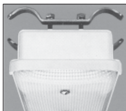
M16377/7-78.2 Rail Mount, Clear and White Prismatic Window