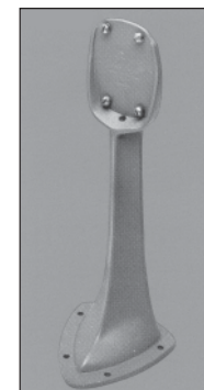
M16377/16-001 Pedestal Assembly NSN 6230-00-336-5876

Net Weight: 2 lbs. 7 oz. maximum. Approximate shipping weight for package of ten: 42 lbs