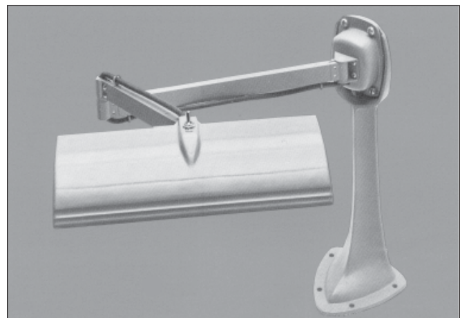
M16377/16-150.2 Pedestal Mount